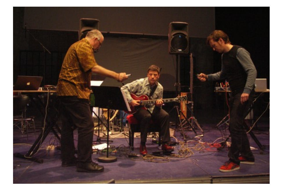
FIGURE 1: SAFARI TV PERFORMED LIVE.

The tension between absence and presence can also be manifested via juxtaposition in the time domain , as gaps of silence. In several of Morton Feldman's pieces the composer introduces lengths of silence between instrumental gestures. His piece Rothko Chapel (1971) for viola, solo soprano, chorus, percussion and celesta evokes absences on many different levels. The piece was written in memory of Feldman's friend the artist Rothko who had committed suicide. As Alex Ross (2008, pp. 530-31) points out, the piece also refers to the 'voice of God' in Schoenberg's Moses und Aron , to Stravinsky's Requiem Canticles and a melody reminiscent of the synagogue. Instrumental passages provide a 'frame' for the silences: the presence of sound prepares the scene for an 'absence' manifest in periods of silence. In a sense, a phantom of sound spills over into the silent passages. The audience has the active role of imagining sounds, or the possibility of their occurrence.